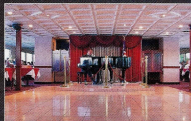
3500 square-foot indoor main salon with a 464 square-foot marble dance floor

Reservations: (703) 683-6076 www.dandydinnerboat.com dandy@dandydinnerboat.com