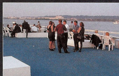
3700 square-foot upper, outer deck

Departing from and returning to beautiful, historic Old Town Alexandria, Virginia. Only 15 minutes from Washington, D.C.